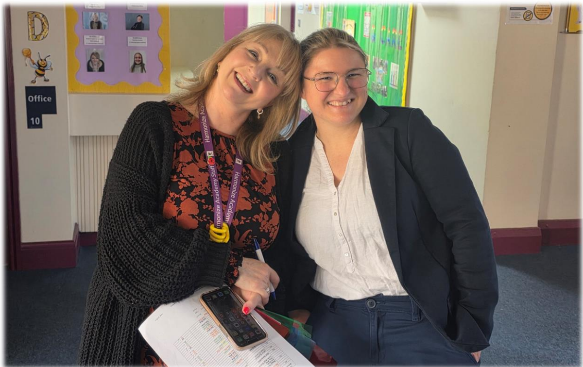
With our 1-1 Support Coordinator