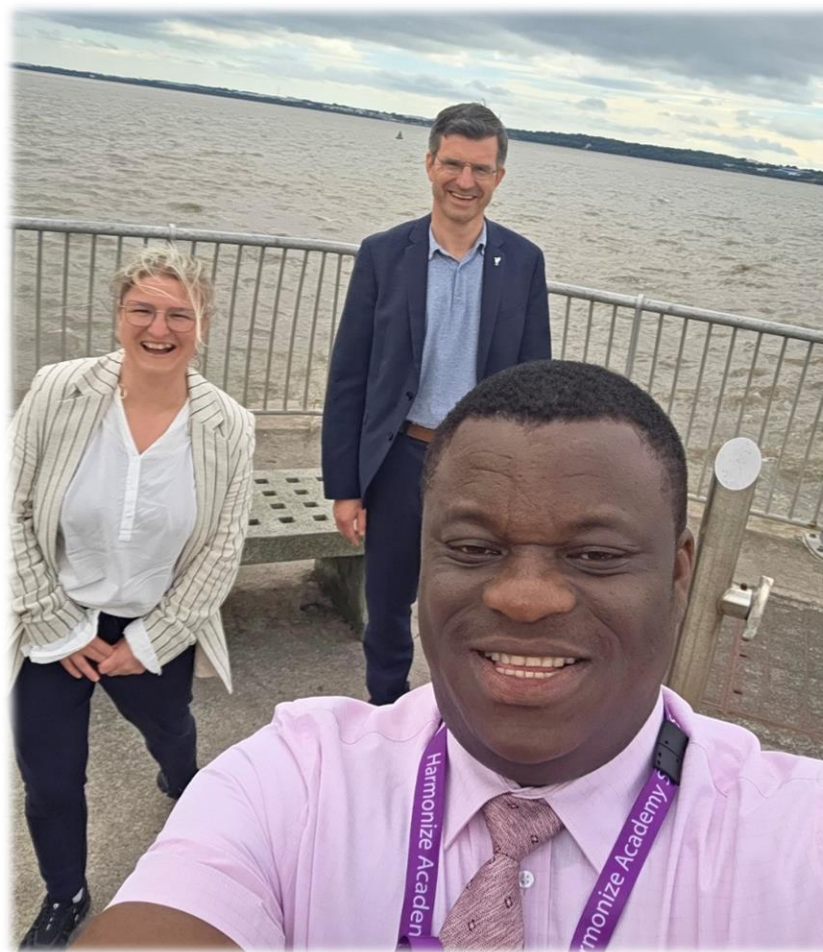
Arrival at Manchester Airport and a visit to Otterspool Promenade, Liverpool