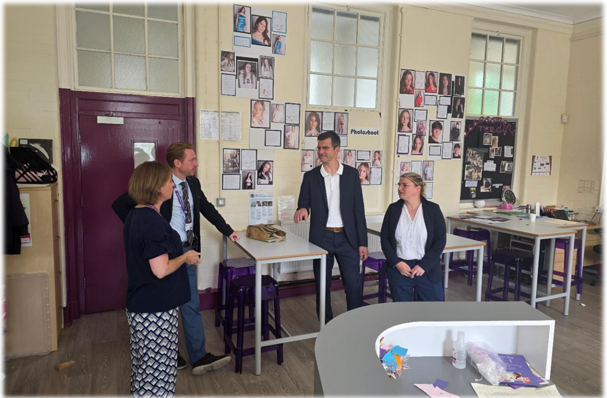
A tour of the Hair & Beauty Salon