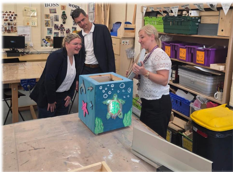
Tour of the Design Technology Department